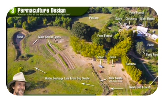
Watch the free on-line video www.GeoffLawton.com

We will use Permaculture design tools and focus on Ecovillage design. There will be guest speakers, visits to local projects and a variety of hands-on practical projects. Each participant will prepare and present a personal design project.